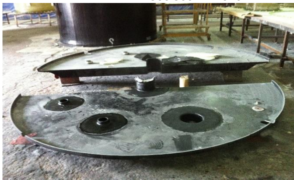
HALF COVER TANK 360-TK-2310