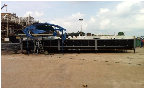
STRIPPING SETTLER 360-TK-2220 (MODUL & COVER)