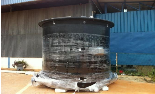
MIXER TANK DN2500 C/W COVER 360-TK-1910