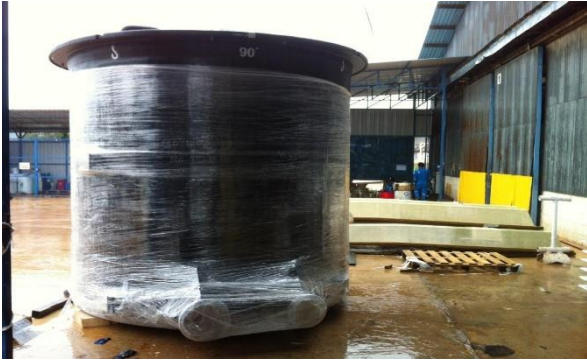
MIXER TANK DN2500 C/W COVER 360-TK-1810