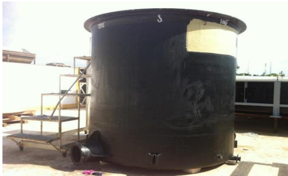
MIXER TANK DN2500 360-TK-2310