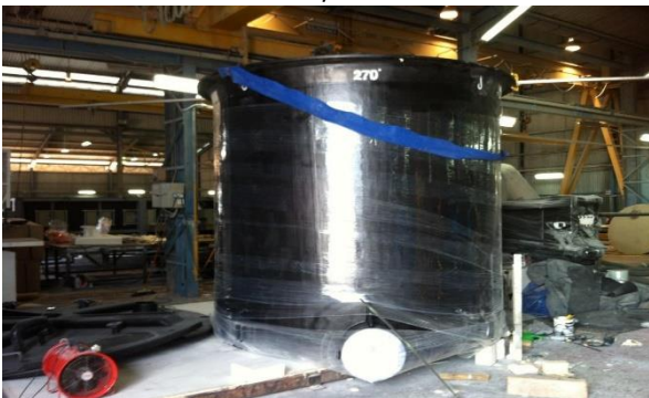
MIXER TANK DN2500 360-TK-2010