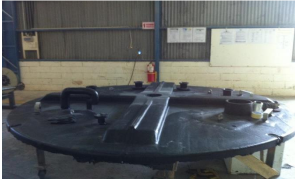
HALF COVER TANK 360-TK-2710