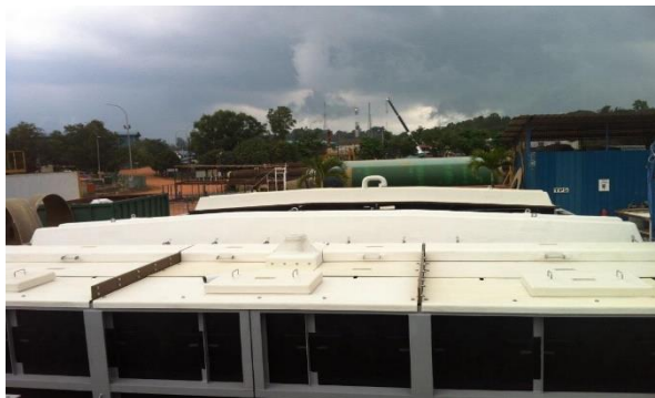
REGENERATING SETTLER 360-TK-2720 (MODUL & COVER)