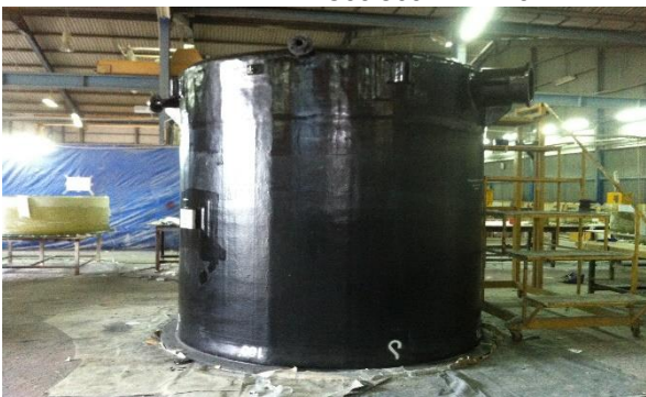
MIXER TANK DN2500 360-TK-2710