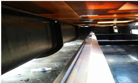
ADJUSTABLE AQUEOUS WEIR WALL ASSEMBLY