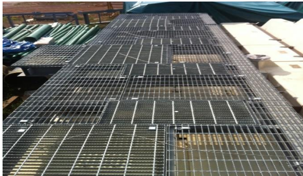
ADJUSTABLE AQUEOUS WEIR WALL ASSEMBLY