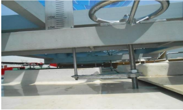
ADJUSTABLE AQUEOUS WEIR WALL ASSEMBLY