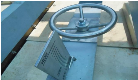
ADJUSTABLE AQUEOUS WEIR WALL ASSEMBLY