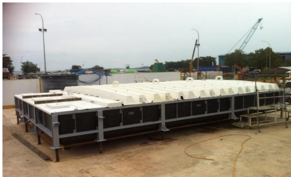
STRIPPING SETTLER 360-TK-2220 (MODUL & COVER)