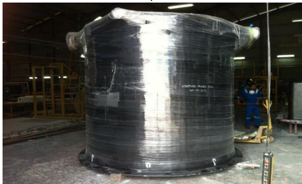
MIXER TANK DN2500 360-TK-2110