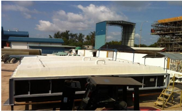
SCRUBBING SETTLER 360-TK-1920 (MODUL & COVER)