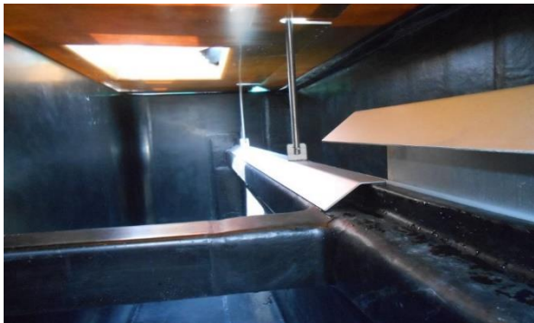
ADJUSTABLE AQUEOUS WEIR WALL ASSEMBLY