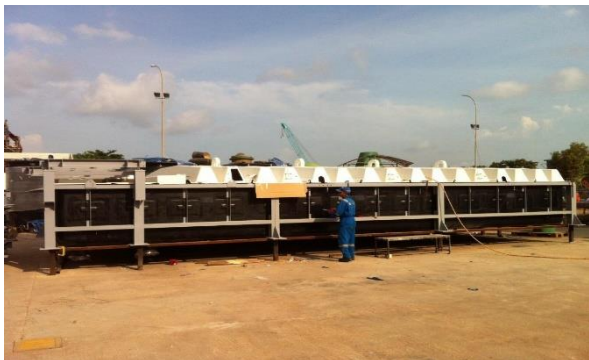
STRIPPING SETTLER 360-TK-2120 (MODUL & COVER)