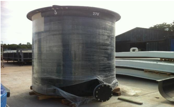
MIXER TANK DN2500 360-TK-2210