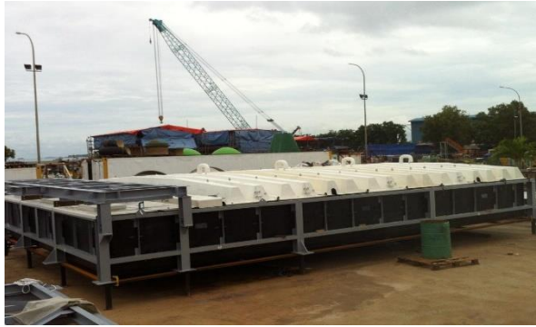
SCRUBBING SETTLER 360-TK-1820 (MODUL & COVER)