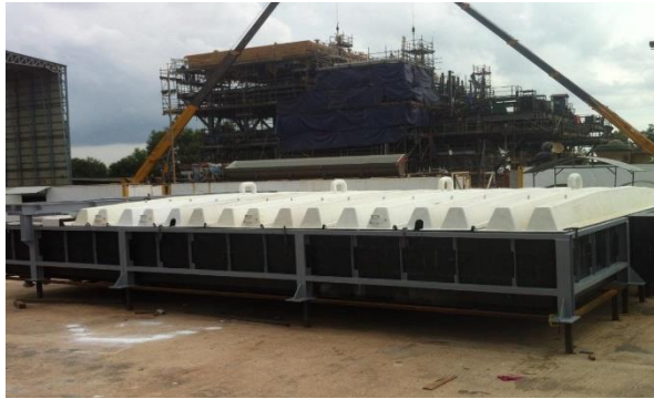
STRIPPING SETTLER 360-TK-2020 (MODUL & COVER)